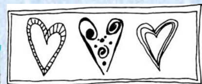
Original 3 Hearts Stamp

This card was made with 505-A ; 3 little hearts, 807-B ; Summer Hummer and 794-AAA ; Je T'aime.