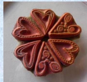
Cut and mounted on an acrylic block